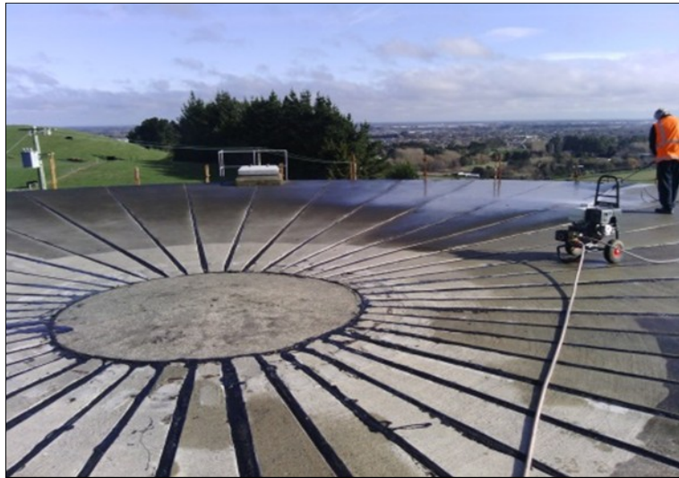
WATERPROOFING CONCRETE WATER TANK ROOF

The project was carried out in August/September 2015 and managed around snow and strong winds. The project was completed September 2015.