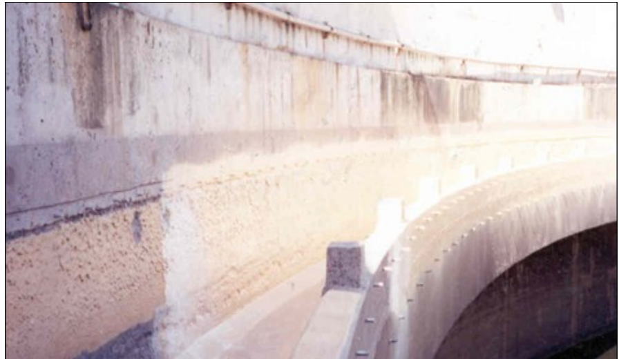
CHEMICAL RESISTANT LINING TO WASTE PROCESSING TANK