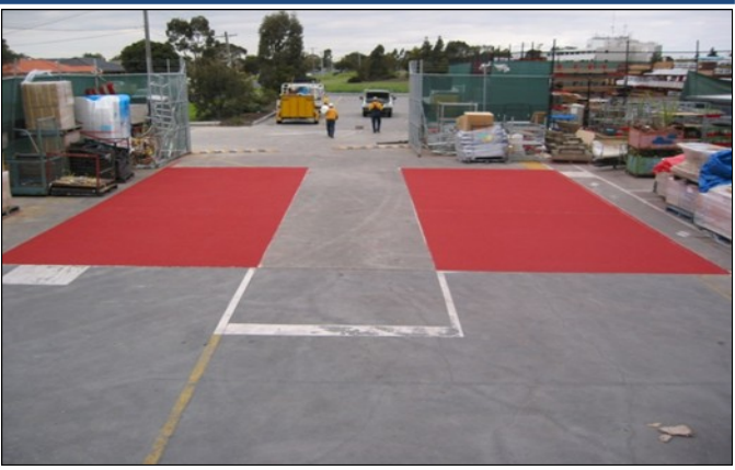
Bunnings Loading Dock