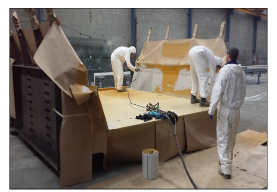
SURFACE PREPARATION AND WATERPROOFING PROTECTION OF WEATHERED STEEL & CONCRETE